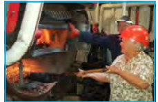
The U3A stokers were fascinated by the engine room and boilers